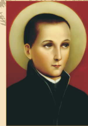
PATRON SAINT ST. JOHN BERCHMANS

“Regarded as model of excellence and holiness for students”